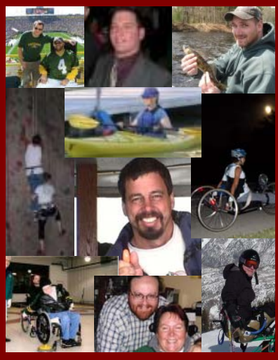
Just a sample of the members in our SCI group!